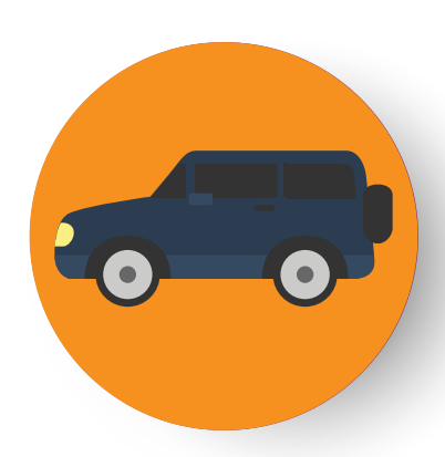
Scholarship recipients must maintain full-time commuter status throughout their MVC academic career.