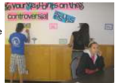
Students participating in "Constitution Alley"