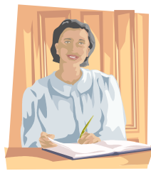
Not actual picture of Carrie

Murrell Library is honored to include the lovely, talented, incredible, sharp, prompt, friendly, magnificent, intelligent, helpful, cute, unique, vibrant, likeable, creative, enthusiastic, versatile, diplomatic, resourceful, compe-