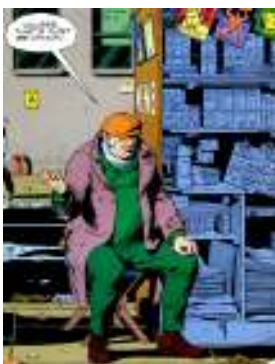
Image from Alan Moore's Watchmen