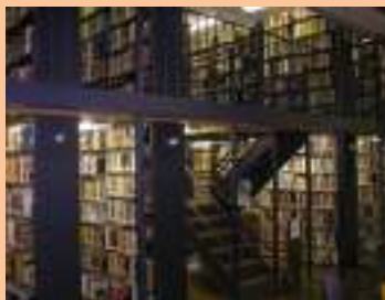
It's not a labyrinth, it's the stacks.

find journal articles pertaining to all sorts of topics. The Quest Catalog is also located on the library page. Quest not only shows all of our books, but books which