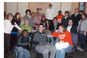
Poe Murder Mystery Night participants.